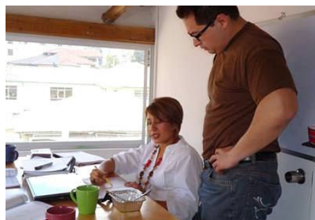
Staff discuss lesson plans at break time...