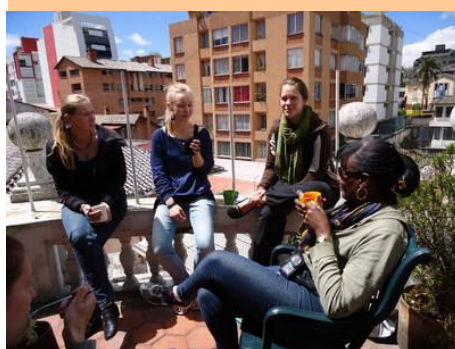
while students enjoy the sunshine!