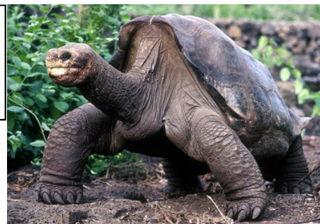
Lonesome George, the last of the giant Pinto tortoises died in June. An icon for conservationists, he was believed to be over 100 years old.

Our principal focus in the foundation for the past two months has been to launch a project funded by a UN fund for indigenous communities. The project will work with a group of youth and women in the Tsa'chila community of Bua, working to develop their self-esteem, organizational abilities and entrepreneurship skills, with the aim of developing small crafts-related businesses in the future. We have commissioned an expert from the ethnographic museum Mindalae to visit the Tsa'chila communities to engage in a process of evaluating their traditional craft production and identifying new possibilities for commercial applications.