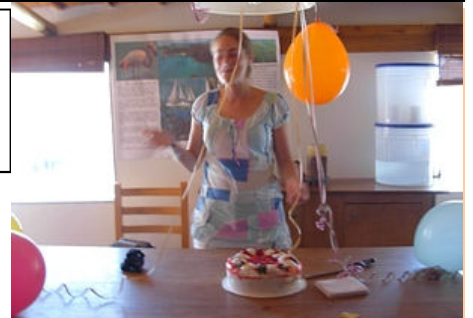
Celebrating a birthday in the Spanish School!

Our Study and Travel programs have been busy in July and August, as they are usually popular with students in the summer months who want to make the best of their time by studying Spanish and seeing the wonders of Ecuador at the same time.