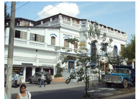
Our Spanish school is housed in this historic building on the edge of the main tourist area.