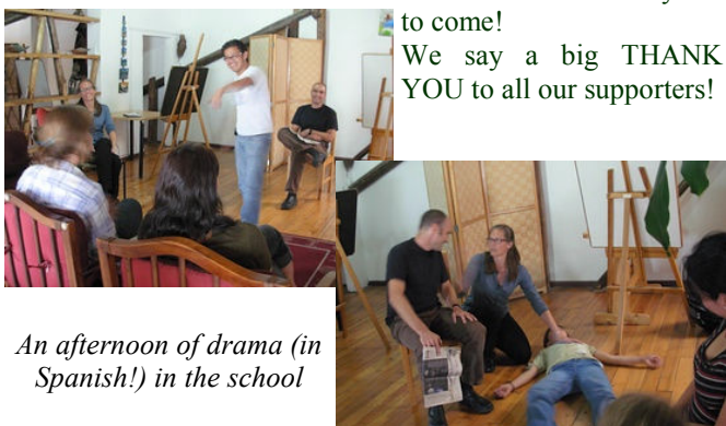
An afternoon of drama (in Spanish!) in the school

We say a big THANK YOU to all our supporters!