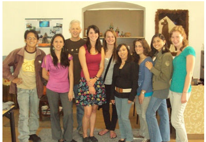
Staff and interns of Yanapuma Foundation