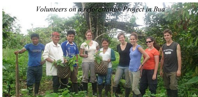
Volunteers on a reforestation Project in Bua

But these are the challenges of the work that we have set ourselves and we continue with patience seeking ways to address these issues.