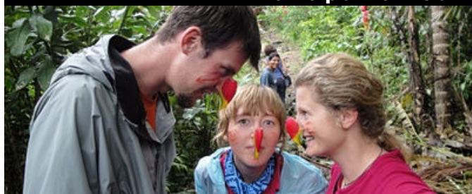
Students enjoy a jungle hike on a Study and Travel program