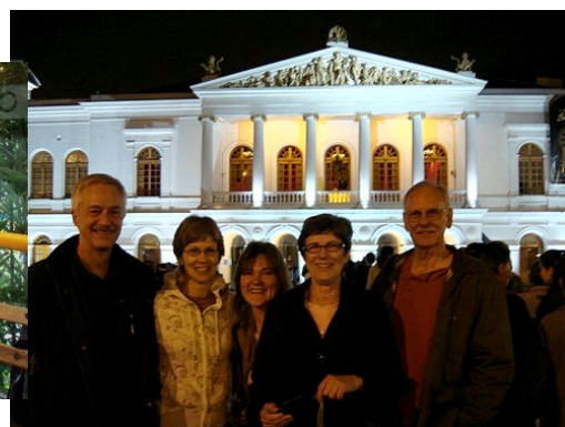
Students visit the historic center of Quito at night