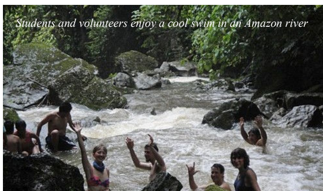
Students and volunteers enjoy a cool swim in an Amazon river

The second document, with similar aims, is a short newsletter in Spanish for the teachers and other staff that relates recent events and new developments in the organization, both the school and the foundation.