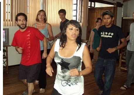
A free salsa class for students each week

During April we have also been busy organizing a change-over in accounting. We have contracted the services of an external accounting firm, e-Valora, who will take charge of our accounts as from May. We hope that this move, although it involves extra cost to Yanapuma, will provide us with a reliable and professional service that will help us grow in the coming years.