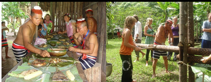
A cultural day at Shinopi Bolon cultural center in Bua