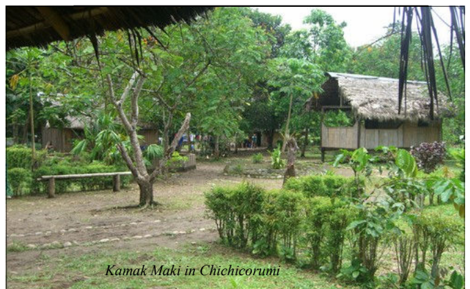
Kamak Maki in Chichicorumi

We are sorry to see them all go, but wish them all the best in their future endeavours.