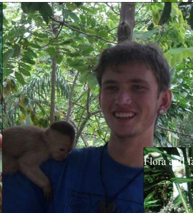
Flora and fauna of the jungle