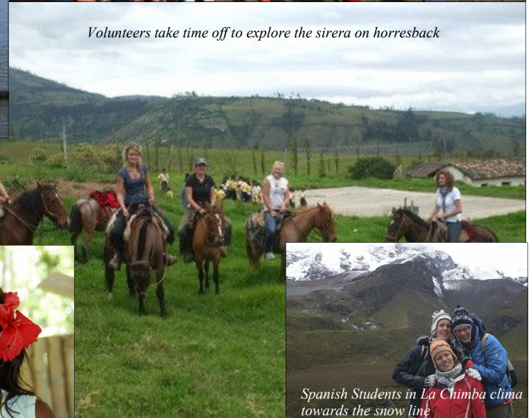
Volunteers take time off to explore the sirera on horresback