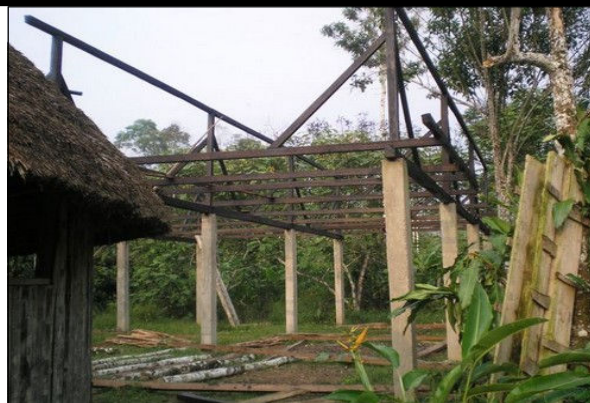
The new museum takes shape in Kamak Maki