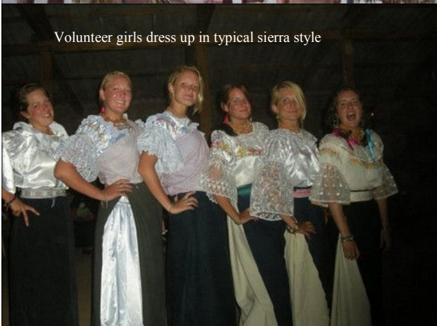
Volunteer girls dress up in typical sierra style