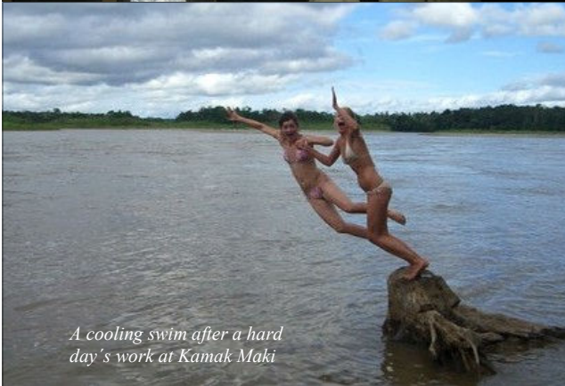
A cooling swim after a hard day's work at Kamak Maki