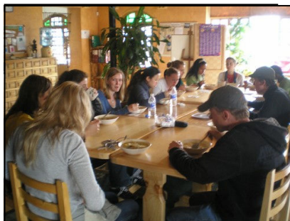
A recent school dinner