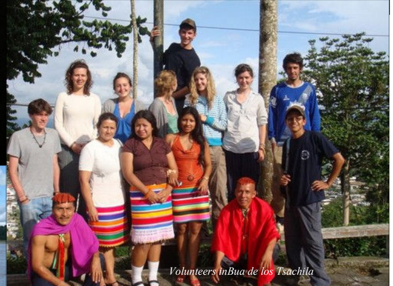
Volunteers in Bua de los Tsachila