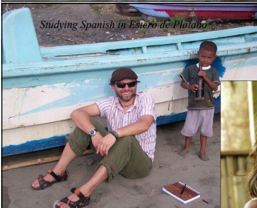
Studying Spanish in Estero de Platanos