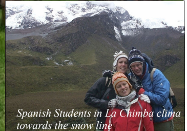
Spanish Students in La Chimba clima towards the snow line