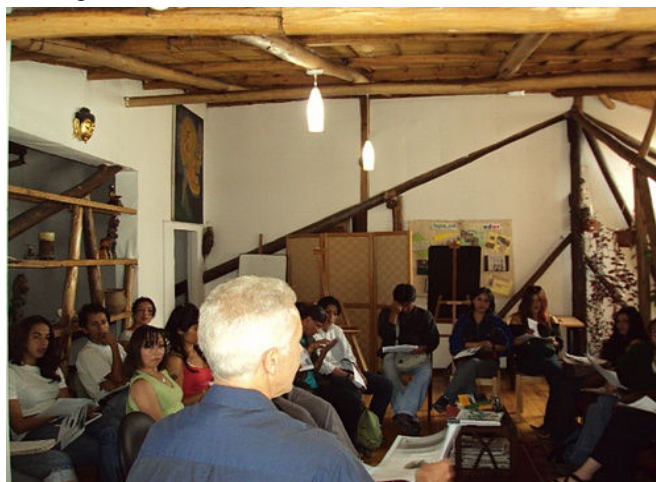
Presenting the Annual Report to teachers and staff

Yanapuma is excited to begin working with Union College in July when two interns will travel to Estero de Plátano to help the community by moving forward our development agenda in various ways including working with the youth, the women's group, the community bank, and in the development of tourism and related activities.